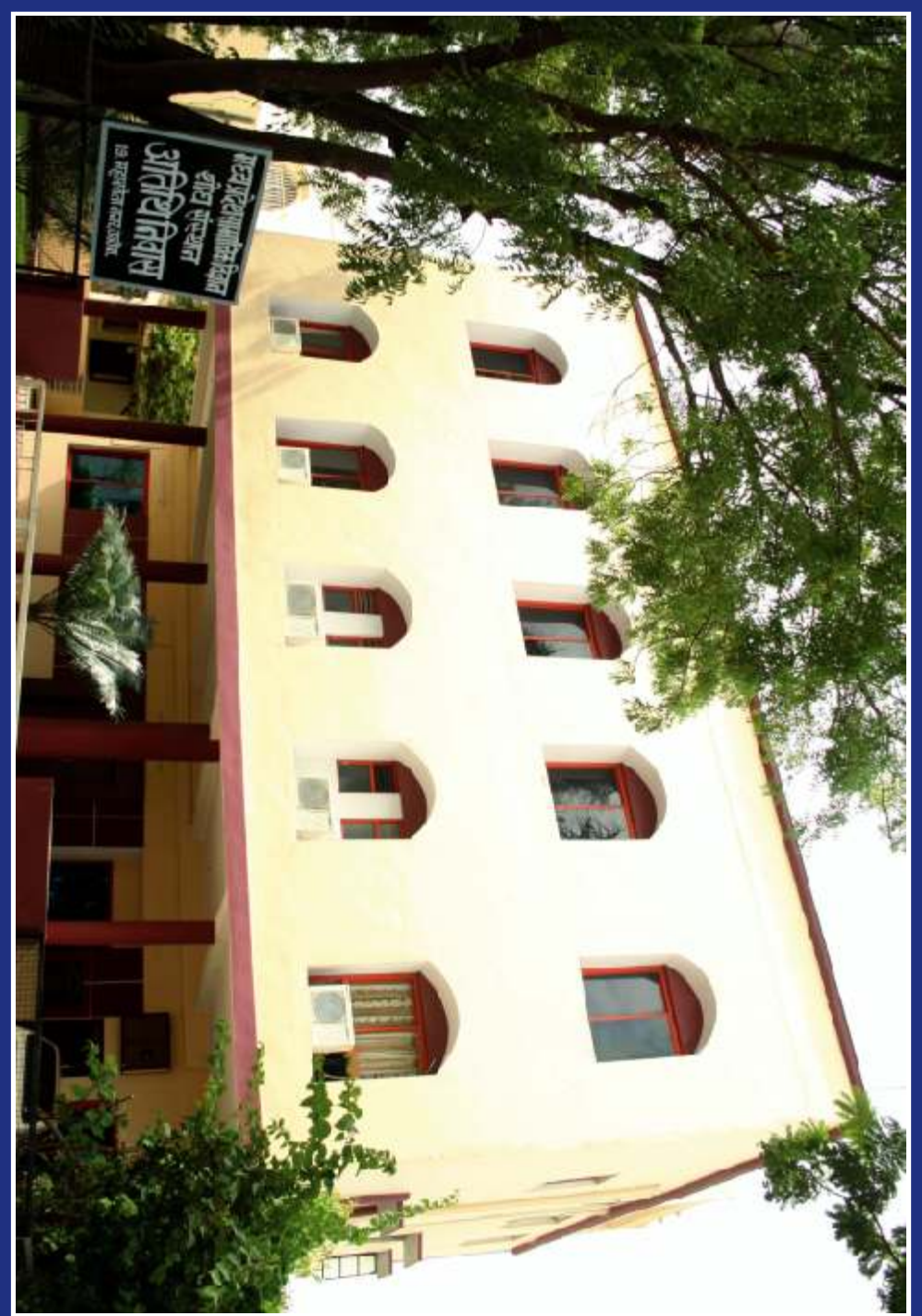
Guest House of MPISSR